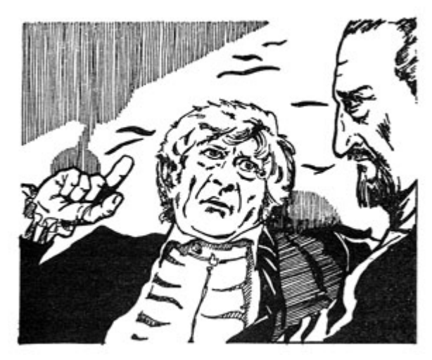
The Doctor was lying where he had fallen, looking up into the Master'rs face.

'Possibly,' said the Master. 'Shall we go?'