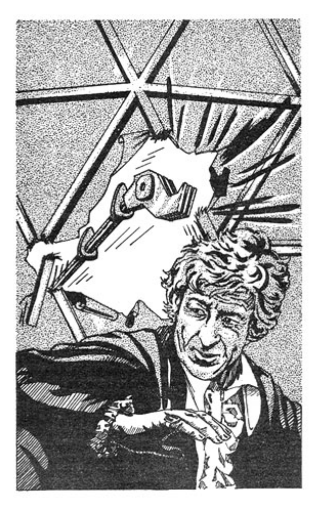
With an earsplitting crash a hole was smashed through the wall of the dome...

From his position on the floor the Doctor couldn't see where the voice was coming from, but it was human and sounded fairly friendly. The Doctor struggled to his feet. A man had followed the robot into the dome, through the hole in the wall. He was a tough, hardbitten man, in his late thirties. He had on a sort of uniform jacket and matching