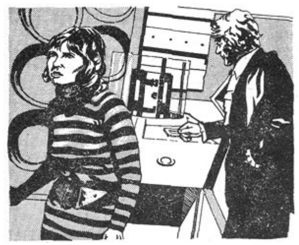
'No little green men with two heads?' queried Jo sarcastically.

The Doctor looked again at the monitor screen. 'Not so far as I can see. Actually, two-headed species in the Cosmos are very rare. There are the Deagles, a sort of two-headed birdlike creature, on one of the planets in the Asphasian Belt, but I've only read about those. I haven't been there yet...'