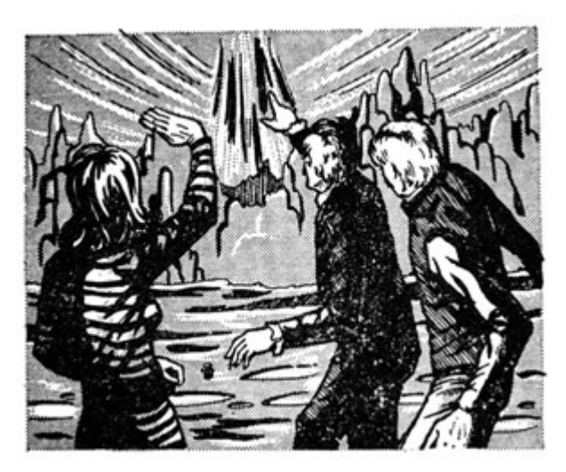
They saw the Master's TARDIS as it raced into the dawn sky.

'Captain Dent left one lookout to make sure no one should escape by leaving the ship,' said Winton. 'I stayed behind and knocked him out. That let all the others get out of the ship to safety before it took off.'