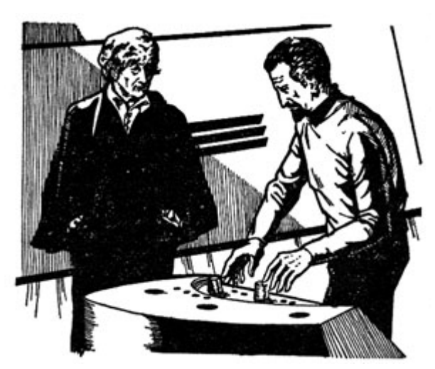
'With the Doomsday Weapon in our control,' said the Master 'we can rule all life...'

Using their buggies for quick transport, Captain Dent and the IMC men were now 35 safe kilometres away from the colonists' spaceship. Only one IMC guard remained near, a volunteer who was sitting lookout on a hill near the colonists' dome, using night binoculars for any sign of the colonists leaving their craft. Once back in his ship, Captain Dent went straight to the control room and sat comfortably in his captain's chair. He turned to the radio microphone.