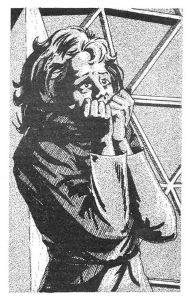
The door was filled with something infinitely more terrifying than she had ever imagined in her wildest dreams.

'No, please,' his wife implored. 'Stay here!'