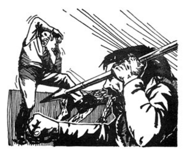
Norton lunged straight at Holden with the spear, aiming for the heart...

'Come with me, please ,' said Norton, grabbing Ashe's arm and pulling him towards the corridor. 'It's terrible! It's murder!'